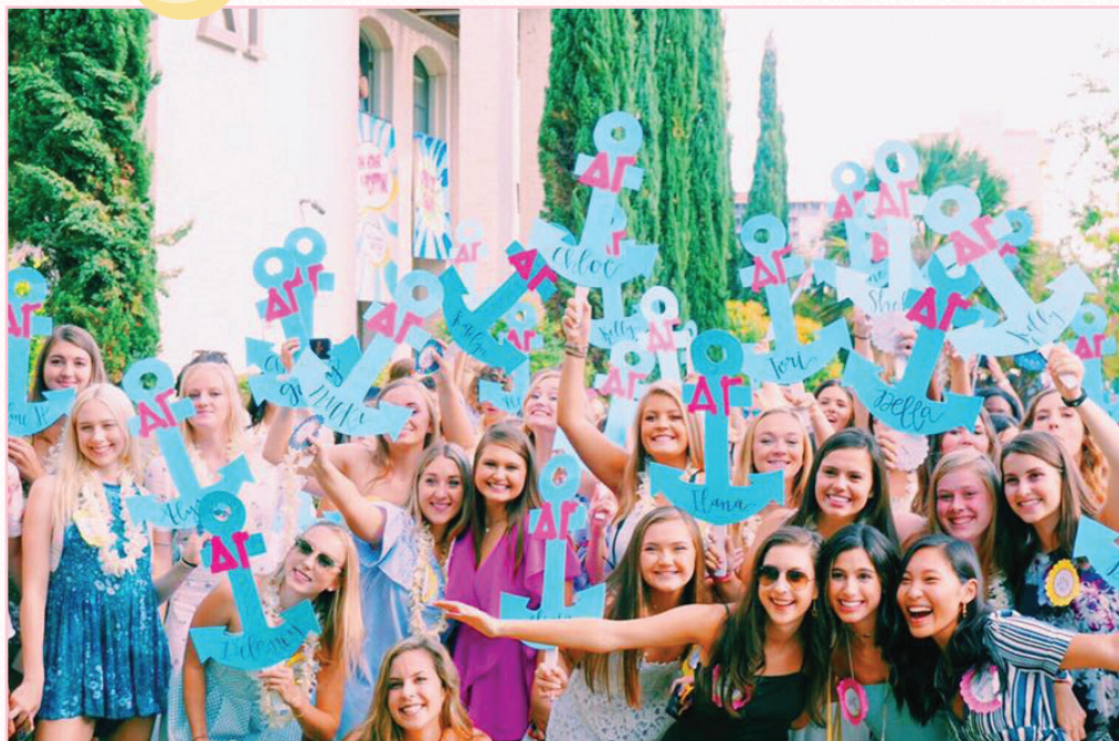
Welcome home, member class of 2018! With anchor signs in hand and smiles on their faces, the chapter waits patiently on Bid Day for all the new members to run home.

DELTA GAMMA | THE UNIVERSITY OF TEXAS AT AUSTIN | SPRING 2019